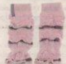
Huggalugs leg warmers $13